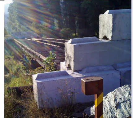
Burned bridge at Calder