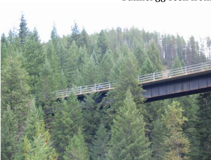
Trestle across Big Dick Creek.