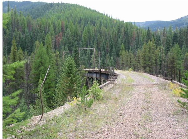
Dominion Creek Trestle